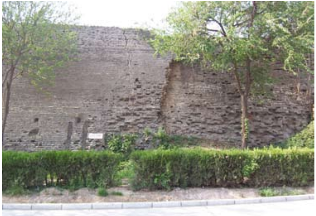
► Figure 1, Shanhaiguan Great Wall.

to achieve more realistic models. Orthophotographs were acquired at the same time as Lidar imagery. The coordinates of the Lidar and camera were determined using both Lidar and ground GPS. The IMU continuously measured aircraft pitch, roll and yaw. An oblique camera was used to map side texture to confirm precise point, line and surface measurements.