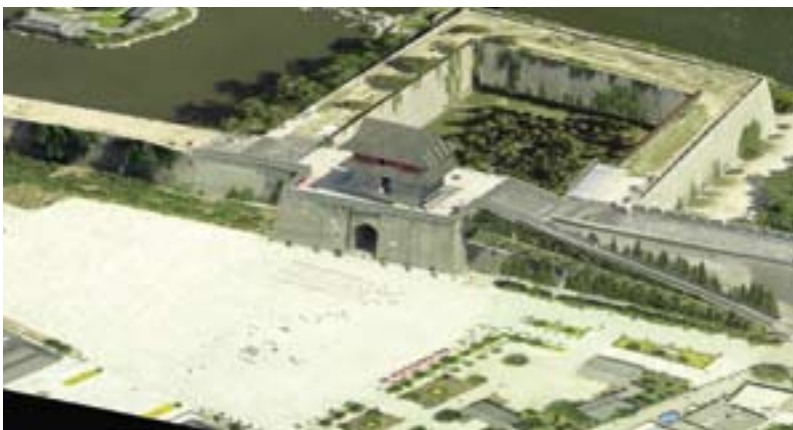
◀ Figure 5, Real 3D-model of Shanhaiguan Great Wall.