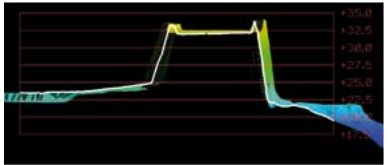
◀ Figure 3, DEM of the wall.